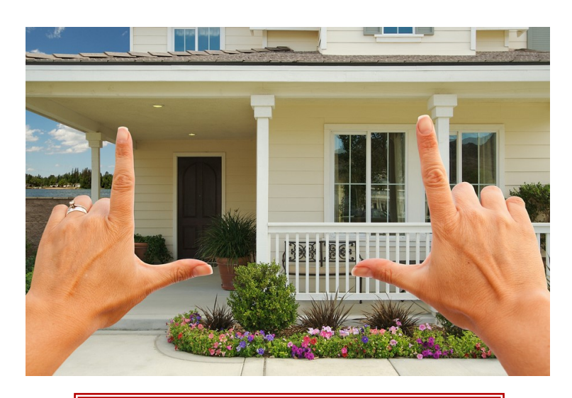
Download How to Hire the Right Agent eBook here!

Even with the best Real Estate Agent, buying a home in a sellers' market can take a lot of your time, so be prepared, be flexible, be ready to move quickly, and be decisive. Now, having said that, don't be too impulsive or too compromising. Urgency is key but don't let it rule your decision either. The right home will show up eventually. Buying a home, whether it's your first home, your forever home, or your retirement home, is a big decision and the last thing you should want is buyer's remorse.