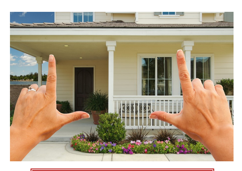
Download <u>How to Hire the Right Agent</u> eBook here!

Even with the best Real Estate Agent, buying a home in a sellers' market can take a lot of your time, so be prepared, be flexible, be ready to move quickly, and be decisive. Now, having said that, don't be too impulsive or too compromising. Urgency is key but don't let it rule your decision either. The right home will show up eventually. Buying a home, whether it's your first home, your forever home, or your retirement home, is a big decision and the last thing you should want is buyer's remorse.